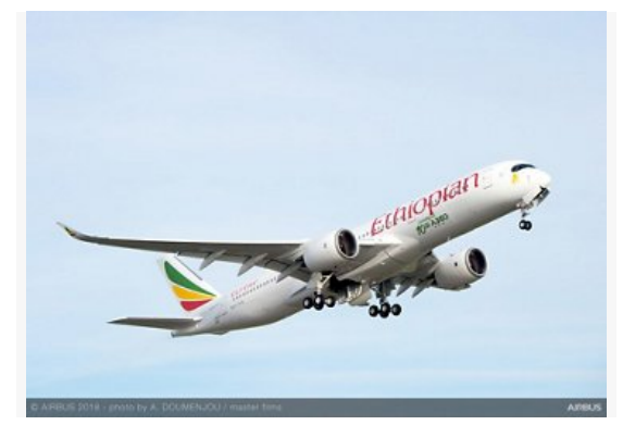
Commercial Aircraft • 07 April 2021