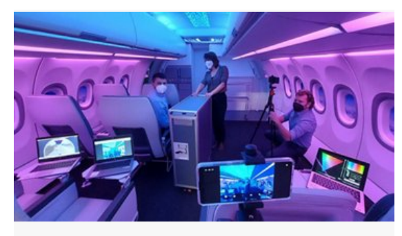
Commercial Aircraft • 01 April 2021